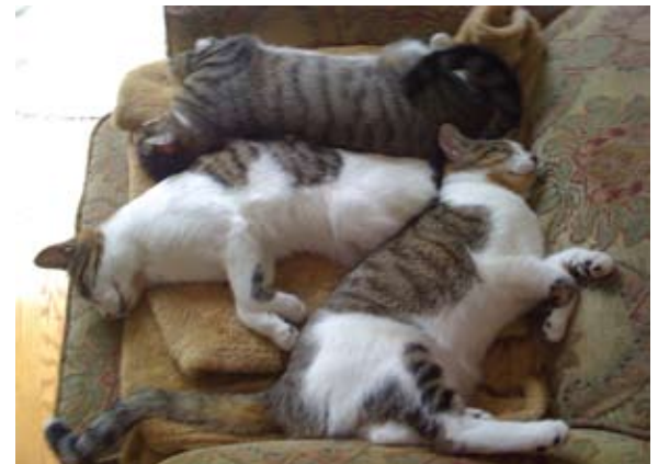
You read all about Kory coming home from the beach in 2008 with 3 kittens. Today they are big lazy cats that sleep about 20 hours a day. Fiyero is the male at the top, Glinda is the girl with the pink nose and Elphaba is the second girl with the brown nose.

decisions involve commitments, people and hours invested that have to be eliminated (with the projects canceled.) But, I focused on working efficiently in 2009 rather than working so many hours.