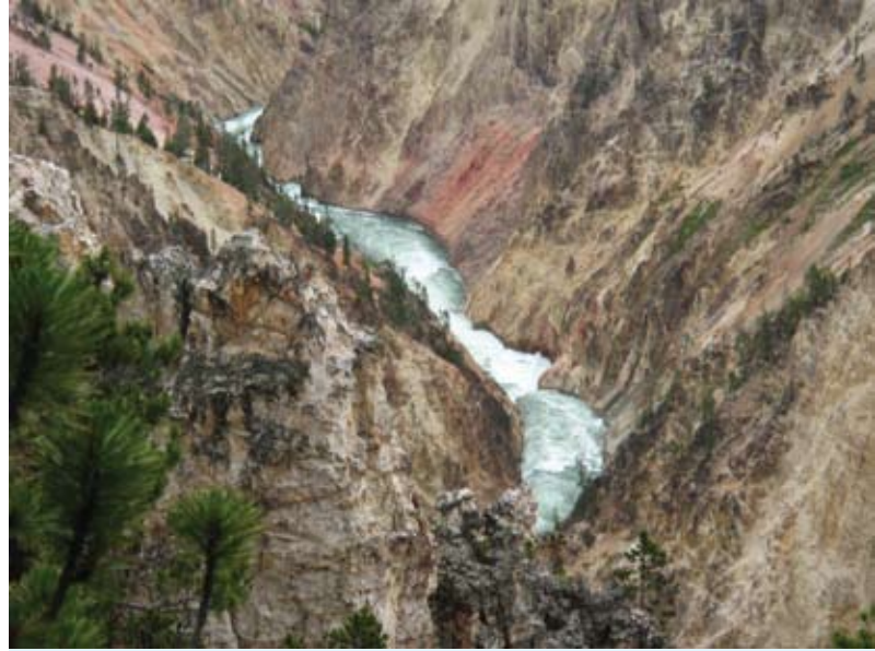
This will take your breath away. Although Kory had plenty of breath as she kept telling us to get away from the edge.

For me, I’m working hard at doing less. Over the last 5 years I’ve added a lot of activities in my businesses, hosting a radio show, publishing magazines, taking on new clients and marketing new services. In 2009, I focused on doing fewer things with more effectiveness. Also, I focused on doing only the things that made money. While it sounds simple enough on paper all of these